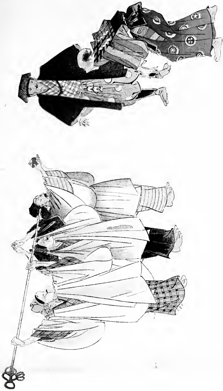
Personators of Jizō (Kiōgen).